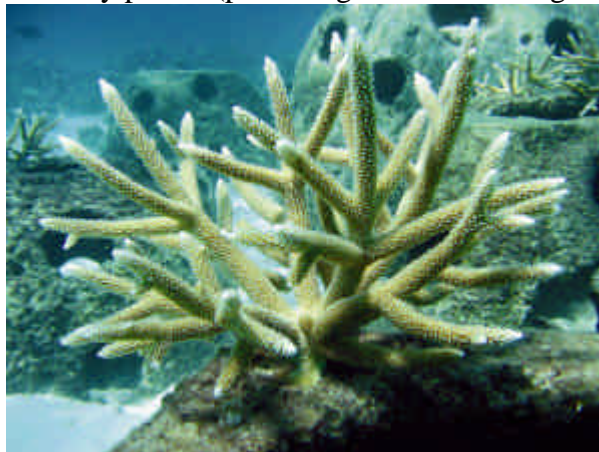
January 2003 survey period