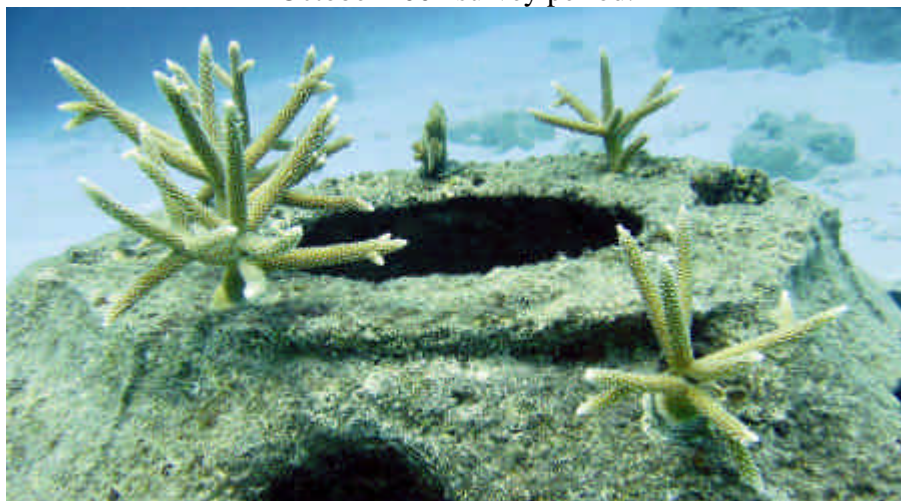
January 2003 survey period.