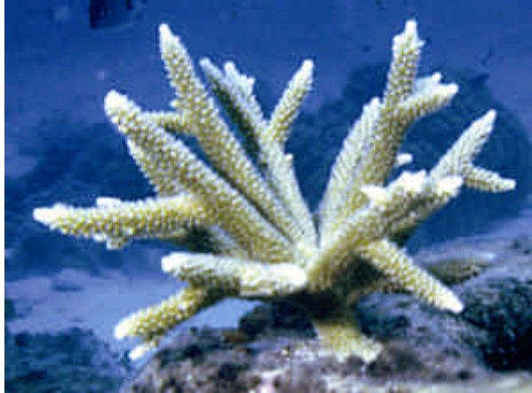
July 2002 survey period

Staghorn coral plug transplanted march 2001.