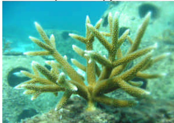
October 2002 survey period (photo angle rotated 45 degrees clockwise)