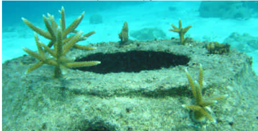
October 2002 survey period.